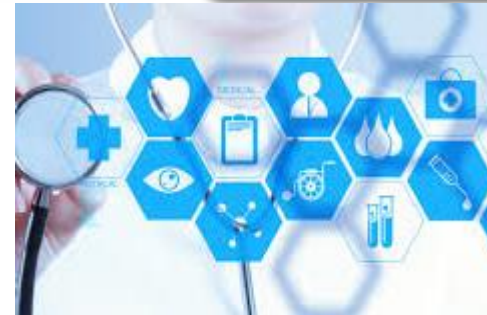
MEDICAL & HEALTHCARE