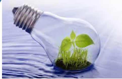
WATER, FOOD & ENERGY NEXUS