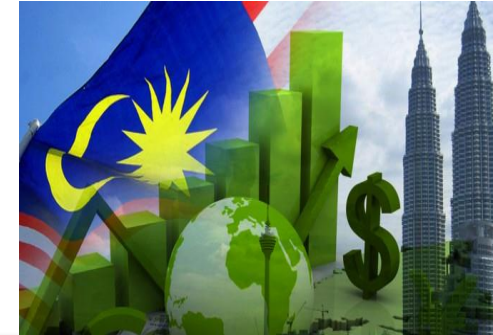
GREEN GROWTH & SUSTAINABLE DEVELOPMENT